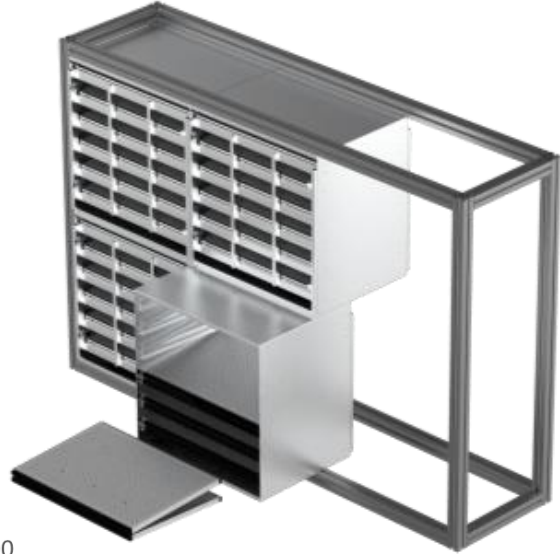
<Installation on filter box>