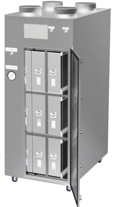
<Filter Installation on EQPT >