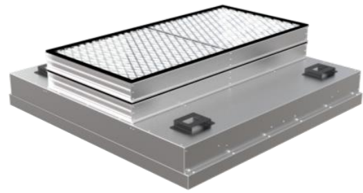
<Filter Installation on FFU >