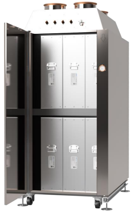
<Filter Installation on EQPT >